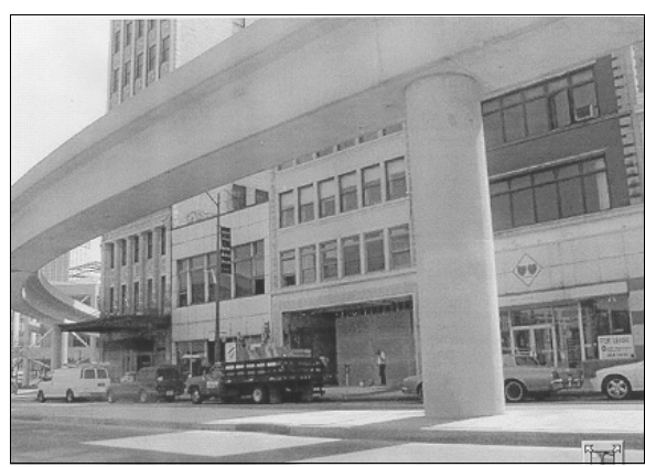
West side of the 1500 block

The first story of the fourteen-story Wurlitzer Building is composed of a curving storefront