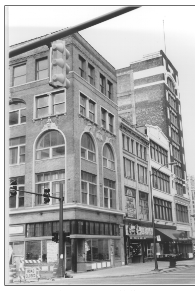
The Cary Building

Individually listed on the National Register of Historic Places on November 25, 1983, The Cary Building is a buff brick and like-colored terra-cotta trimmed, five-story commercial/office building with a reinforced concrete frame. Extending 112 feet along Gratiot Avenue and thirty-four feet along Broadway, the building displays broad, round, segmental-arched and square-headed window openings in its 2<sup>nd</sup> through 4<sup>th</sup> story portion and paired square-headed windows in the top floor. In the 4<sup>th</sup> floor a small ionic column separates the windows in each window pain in the Broadway façade and each end window pair on the Gratiot façade. The windows in the 2<sup>nd</sup> through 4th floor center bays on the Gratiot side are set into segmental-arched head recesses, while the 3<sup>rd</sup> story windows on the Broadway façade and ends of the Gratiot façade are arched. The recesses and arched windows all display boldly